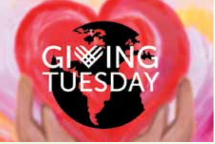
ORIGINAL ART BY CYNTHIA FLOWERS